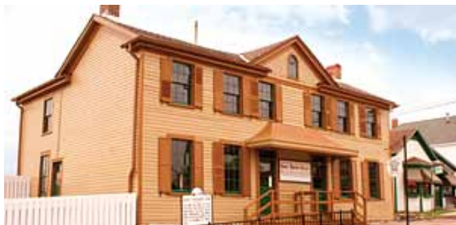
Becky Thatcher's House

Well, it's that time of year again. It's time to plan to attend the MATR 2013 Annual Convention. Although most of you reading this article have not attended this event in years, this year would be a great opportunity to come back. You will be able to reunite with fellow recyclers and members you haven't seen in years and enjoy a yard tour of one of the most innovative recyclers in our state. We will be visiting J.C. Auto and Truck Parts for a behind the scenes tour and lunch.