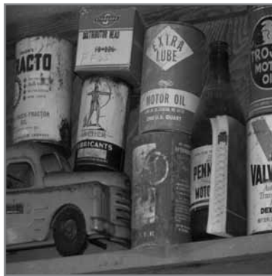
If your shelves look like this, you may be fined by OSHA!

OSHA requires that chemical manufacturers must identify the potential hazards of each chemical product and how to work safely with that product in a document called a material safety data sheet (MSDS). Manufacturers or suppliers then must ensure that their customers - YOU - are provided a copy